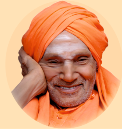
Dr. Sree Sree Sivakumara Swamiji Founder president Sree Siddaganga Education society