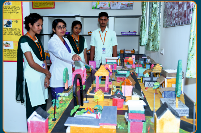
Community Health Nursing Lab