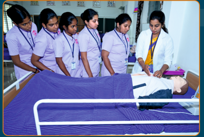
Nursing Foundation Lab