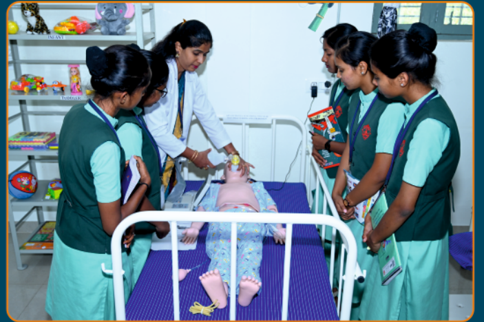
Child Health Nursing Lab