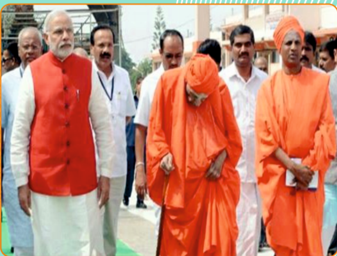
Honourable Prime Minister Shri. Narendra Modi with Rev. Swamiji on 24th September 2014