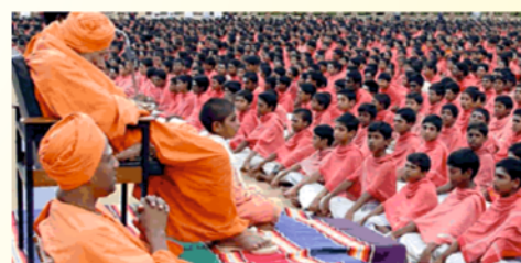
Mass Prayer at Sree Siddaganga Math

In the year 1902, His Holiness Sree Sree Atavee Swamigalu started a small Sanskrit Gurukula, where free education in the ancient text was imparted. This small effort later became a college in 1937 during the period of His Holiness Sree Sree Uddana Shivayogi Swamiji's time. Sree Siddaganga Math has become a unique Gurukula providing education to more than 10,000 poor children with free food and shelter. The strength of this Gurukula service has steadily grown in years, as there was only one teacher and 20 students when it was started. By the year 1917, there were about 40 students belonging to all faiths and communities. When His Holiness Sree Sree Sivakumara Swamiji assumed the full responsibility in 1941 there were about 200 students. The ceaseless and untiring efforts of Sree Sree Swamiji have resulted in the present magnitude of more than 10,000 children. For the un-matching period of 88 years His Holiness was the head of this holy place. Even at the age of 100+, he was very active, agile, with unfailing sight and stable movements. Probably in the religious history of any country, he may be the only one, who has been a head of a holy place which is secular in act, for such a long and continuous period.