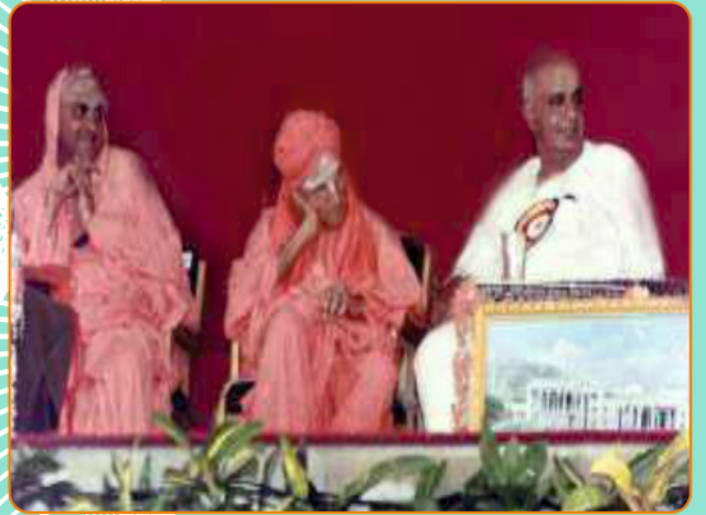
Honourable Prime Minister Shri. H.D. Deve Gowda with Rev. Swamiji during Diamond Jubilee Celebrations